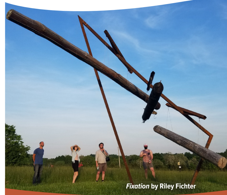
Fixation by Riley Fichter